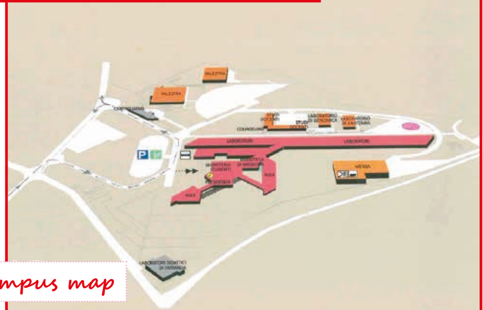
Baronissi Campus map